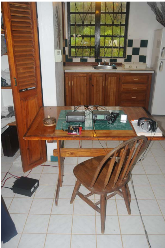
<- J75PX Setup