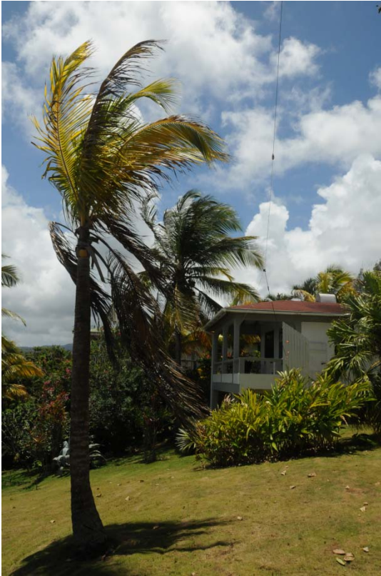
< - My Cottage—If you look closely, you can see the dipole