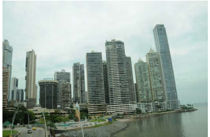
Panama City Skyline