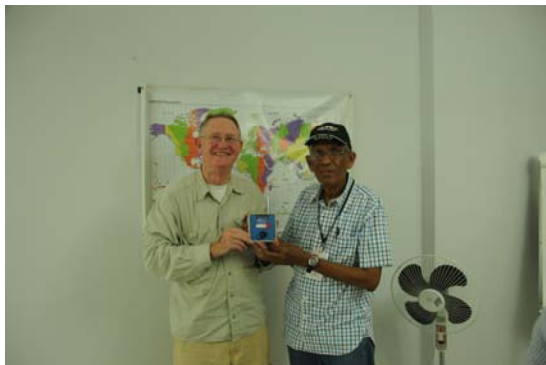
AI5P with Cam, HP1AC, at Radio Club de Panama meeting