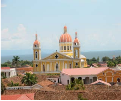
Granada Cathedral with Lake Nicaragua in background