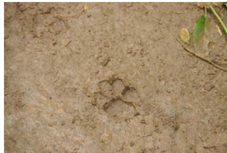
Possible Puma pawprint