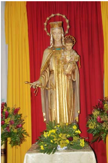
Inside the Cathedral