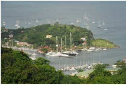
Harbor at St. George