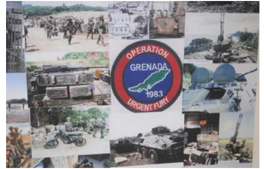
Urgent Fury Museum Exhibit