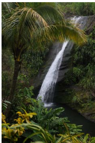
Concord Water Falls