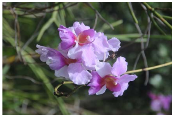
To Left: Orchids