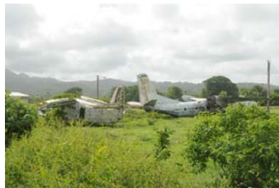
Cuban Commercial aircraft at Pearls Airport—There since 1983 Urgent Fury Invasion