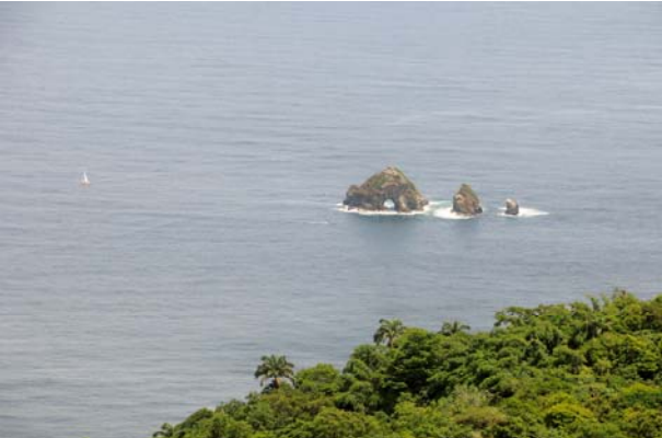
St. Giles Rocks