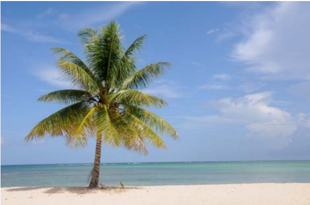
Pidgeon Point Beach