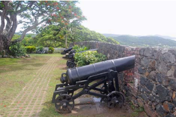
Fort King George