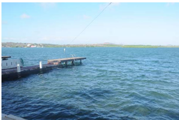
PJ2/AI5P antenna set-up