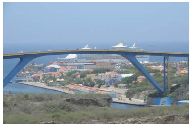
Queen Juliana Bridge with Cruise ship in port