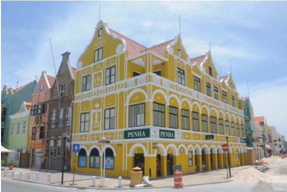
Pastel buildings in Willemstad

On August 31st I departed Curacao for Aruba. Curacao was another unusual island to visit!