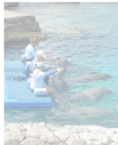
Dolphin Academy at the Sea Aquarium