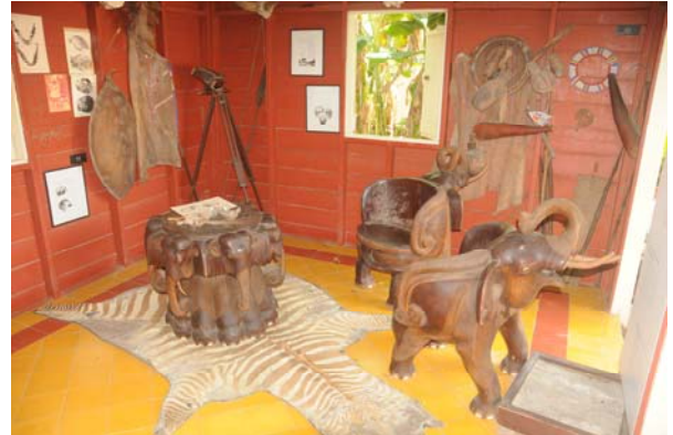
Kura Hulanda Museum