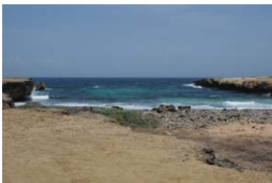
Former site of the "Natural Bridge"