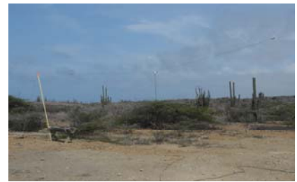
Antenna set-up P40PX