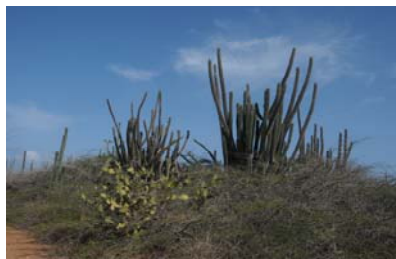
Lots of cacti