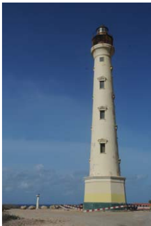
Left: California lighthouse — Right: Butterfly Farm