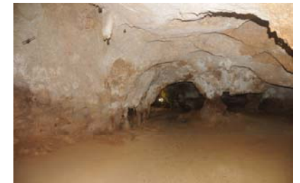
Cave with fruit bats