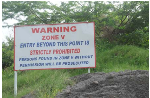
Approaching the town of Plymouth