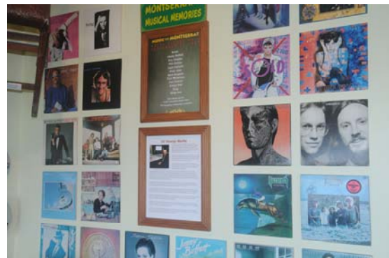
A few of the albums recorded in Montserrat