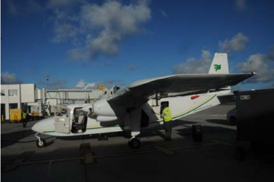
Your transport from Antigua to Montserrat