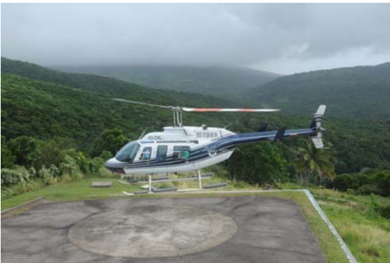
Helo from Volcano Observatory - Soufriere Hills Volcano (3180 ft) in the background - Erupted 1995. Always "socked in" while we were there.