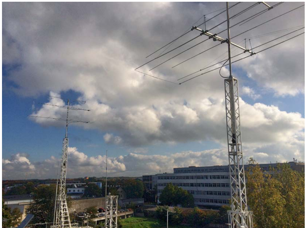
Antenna system - ES1XQ