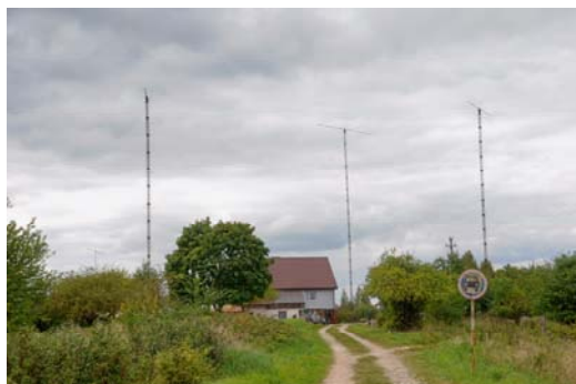
QTH of LY5A