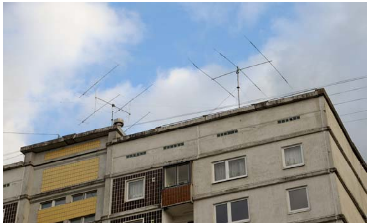
Antenna system - YL2GC