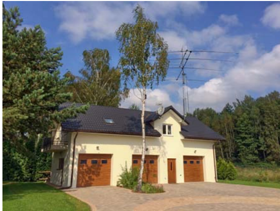
Antenna system - SP9KR

This trip was the first time I had been back to Europe since 2007. Four new countries were visited - Poland, Lithuania, Latvia, and Estonia - along with England. I'll skip the travel notes - too many interesting places - and just pass along some photos of some of the amateurs and their stations that I had the opportunity to visit.