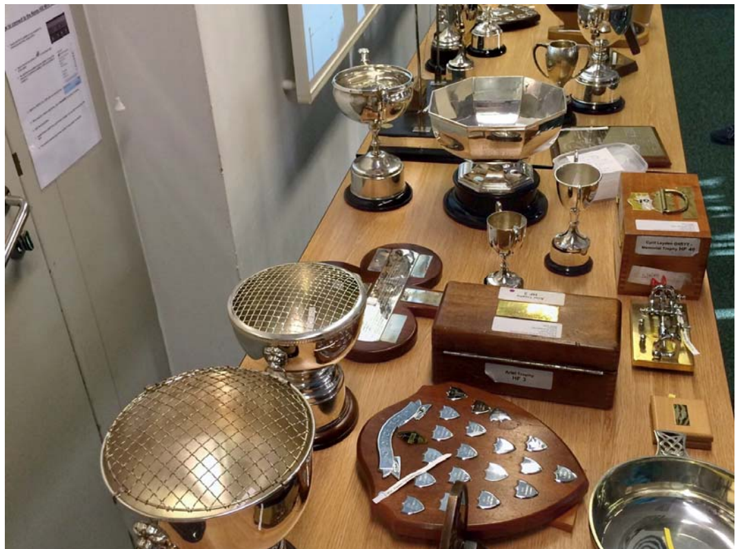
Trophies for presentation at the RSGB Convention