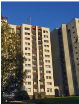
Antenna system and operating QTH of the Vilnius University ARC Station LY1BWB