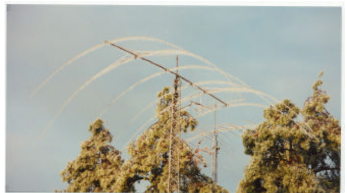
ICE ON THE ANTENNAS AT N5ZM'S QTH (DECEMBER 2000)