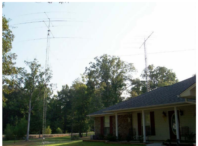
N5ZM QTH with leaves on the trees