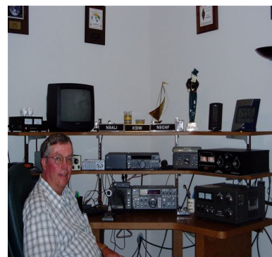
K9IW - ADXA Vice President