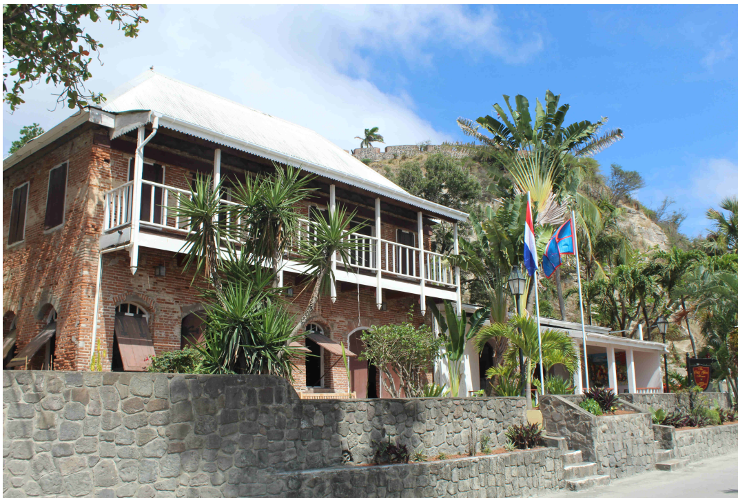
17th century Cotton Gin (now hotel)