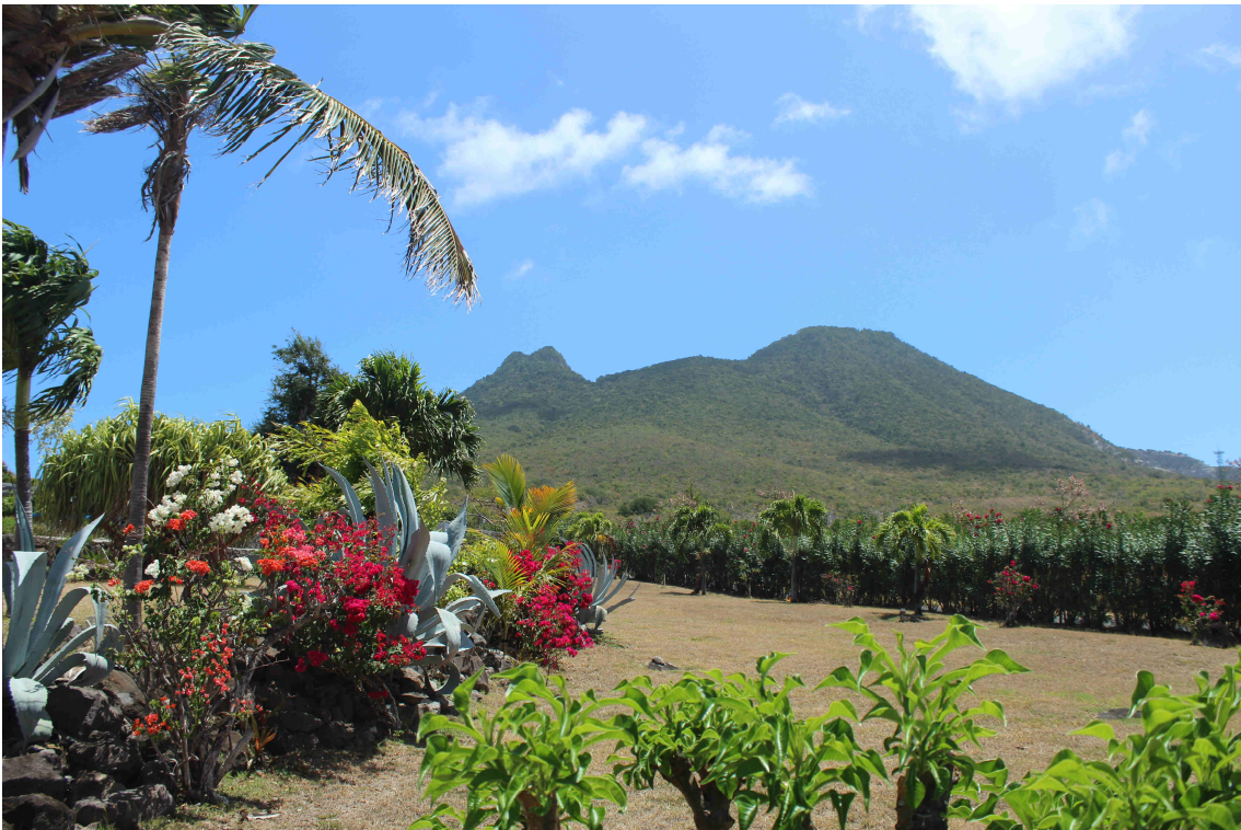
Beautiful views of Statia