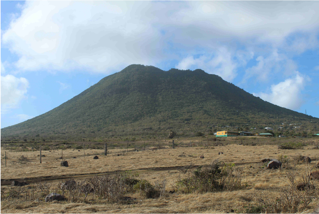
The very imposing The Quill