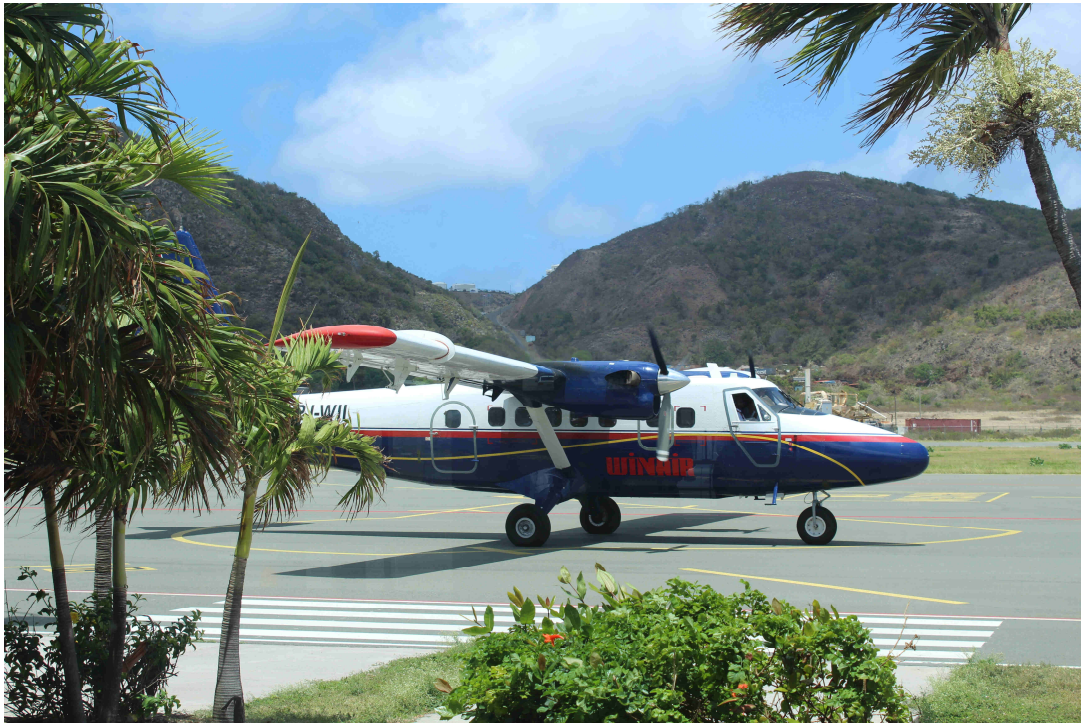
Arriving at the F.D. Roosevelt Airport