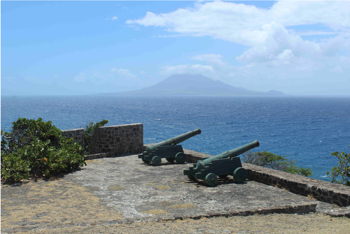
Fort de Windt with St. Kitts in the distance to the south