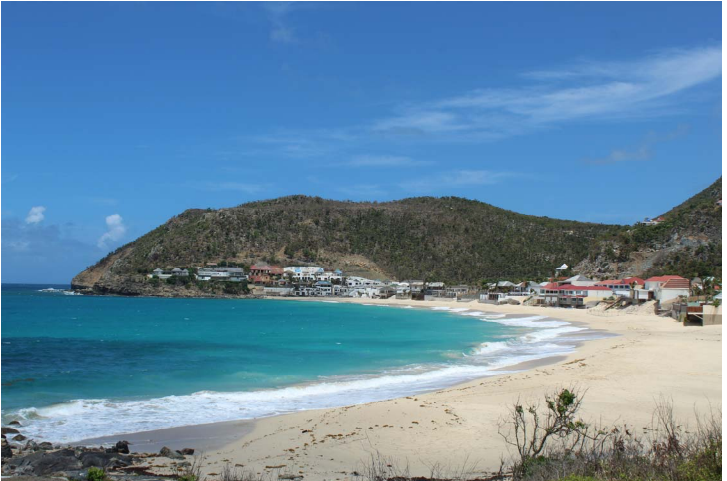
One of St Barth's pristine beaches