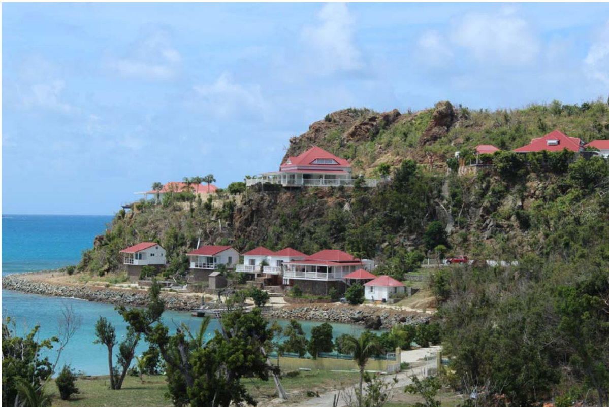
One of the amazing home sites on St. Barths