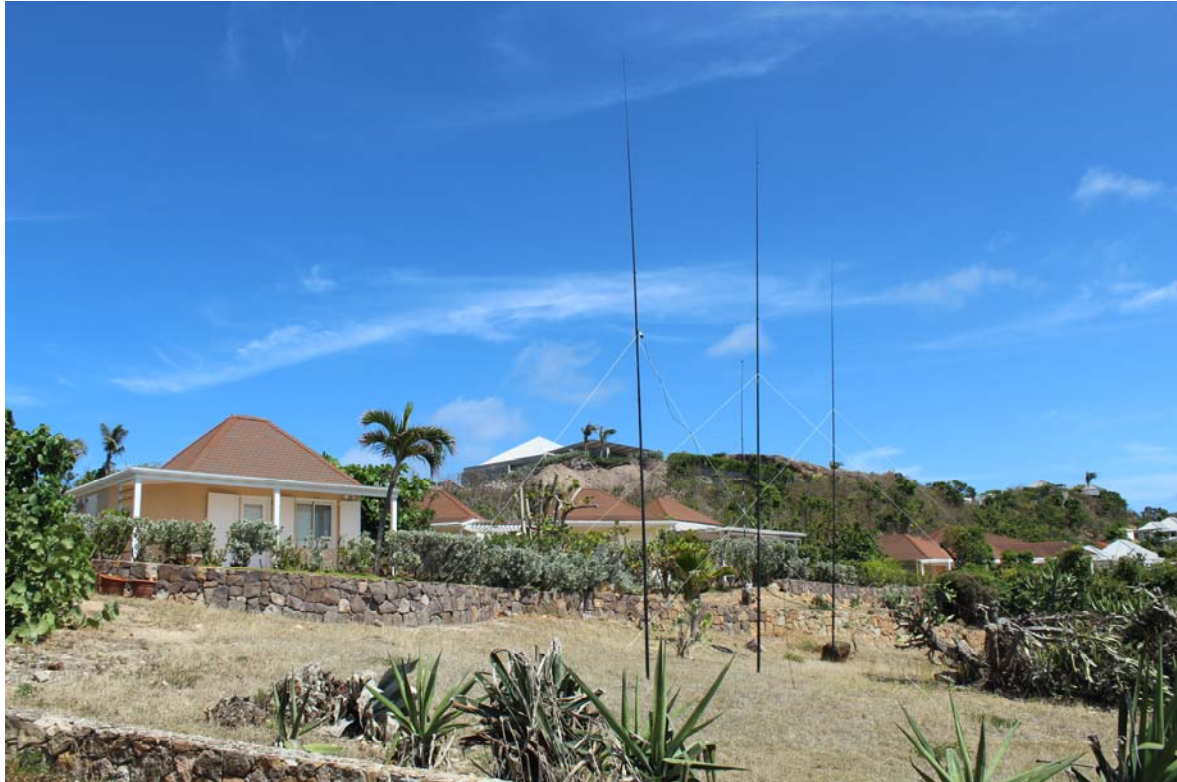
Villa with antenna field