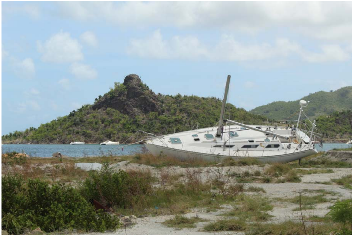
One of the beached and demasted yachts at Sint Maarten