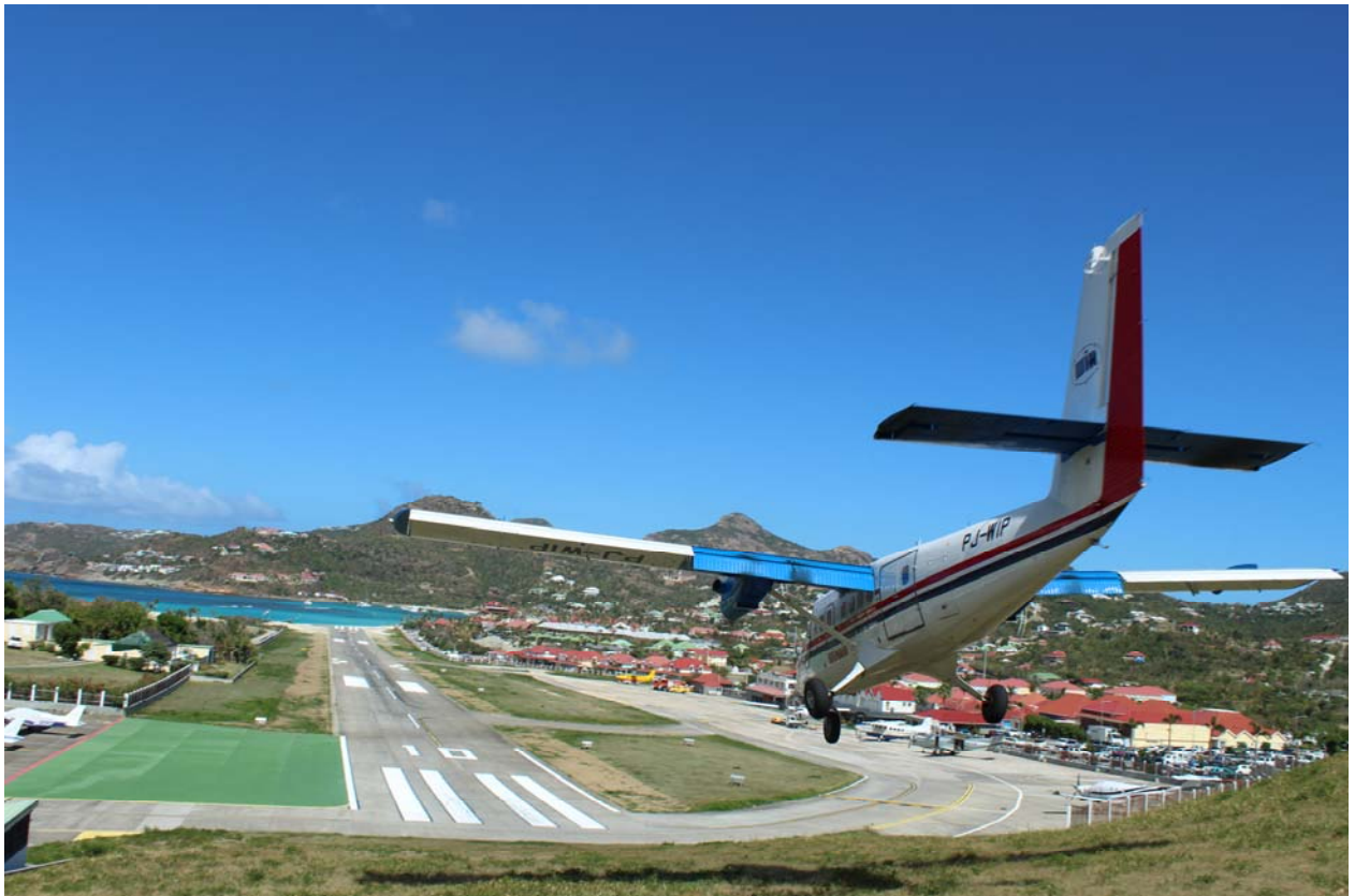
St. Barths airport final approach