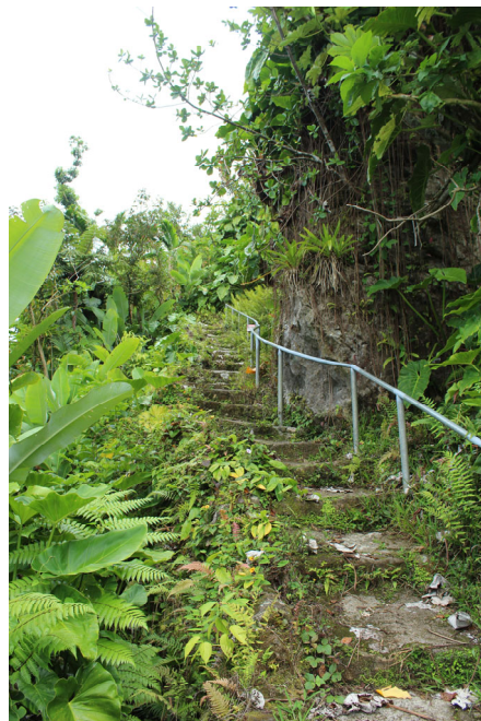
Walking the “Stairway to Heaven”