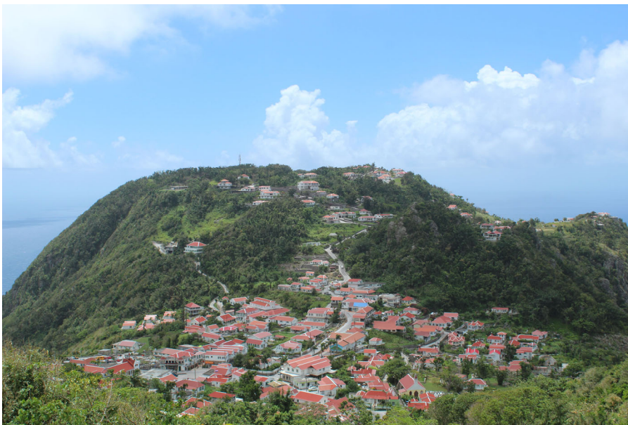
View from Rental—St Eustatius (Statia) in foreground With St. Kitts in the distance