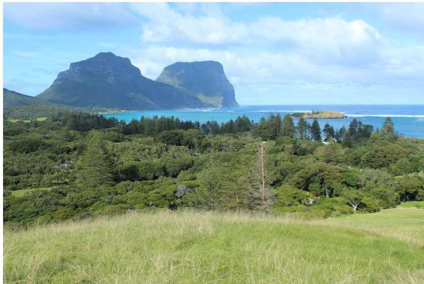
View of LHI with its dominate terrain features of Mount Lidgbird (777 meters) on the left and Mount Gower (875 meters) on the right