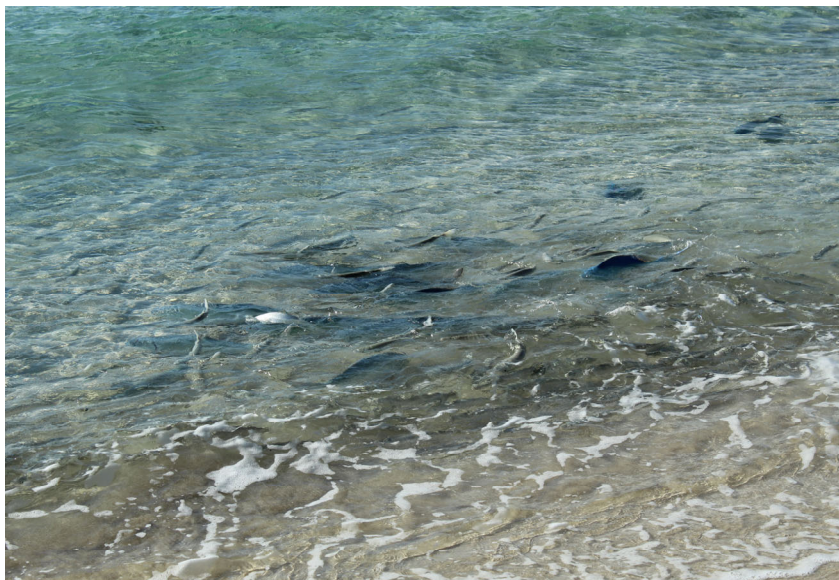
Feeding the fish at Ned's Beach - Quite the sight to see!