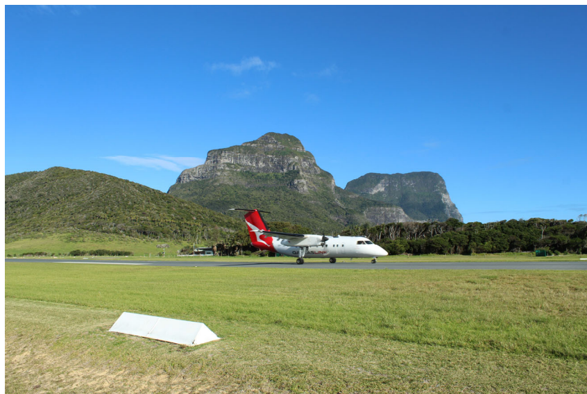
Airport with a Dash-8 taking off