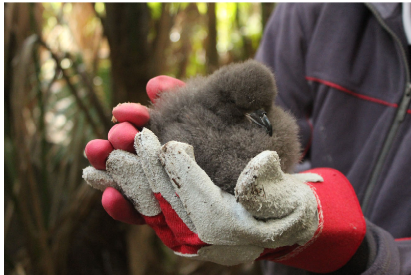
Baby Providence Petrel - Only nests in two locations in the world