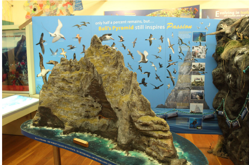
LHI Museum - Model of Ball's Pyramid (Google it!)