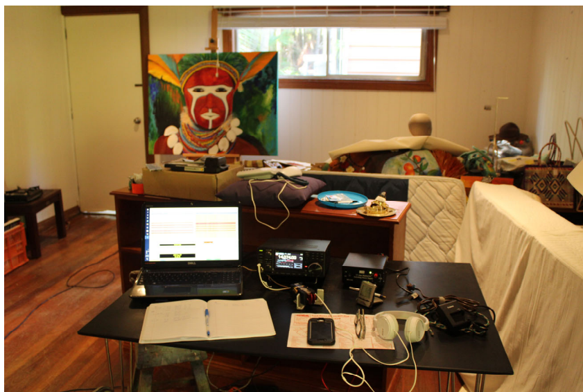
VK9APX station set-up