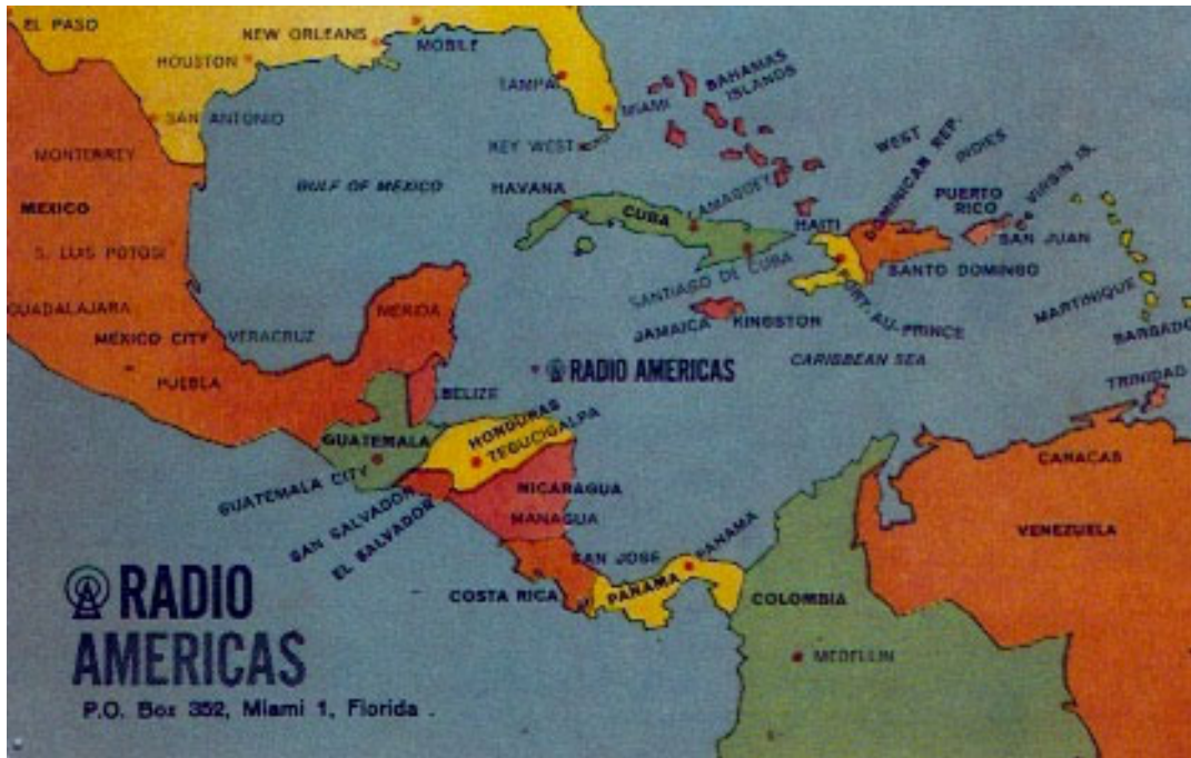
A QSL from Radio Americas I received for reception of their short wave broadcast in April, 1962