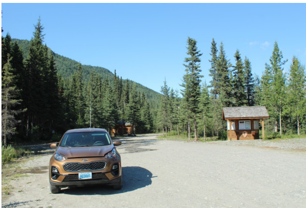
Operating in Wrangell-St Elias NP