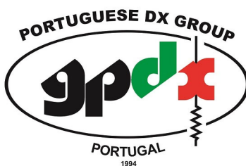
Logo - Portuguese DX Group